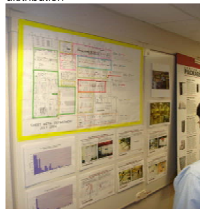
Fig. 2: Rockwell's Sheet Metal Shop innovation boosts throughput.