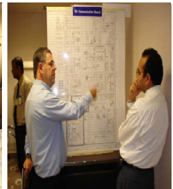
Fig. 3: An Orenda & COM DEV exchange gets very interesting